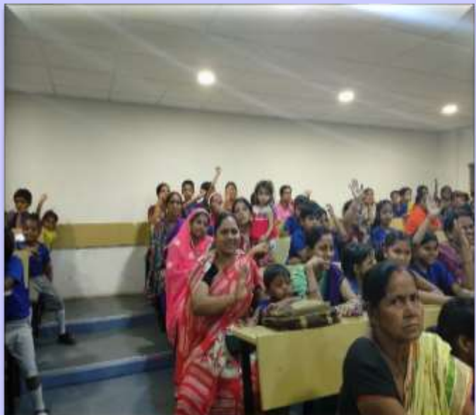
11. Slum (Jyoti Nagar) and Campus cleaning, organized by NSS Unit. Date: 10^{\rm th} March, 2019