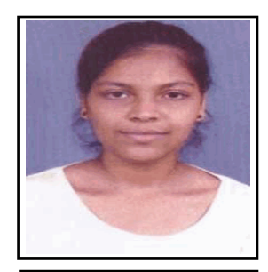
Pours hita Panday