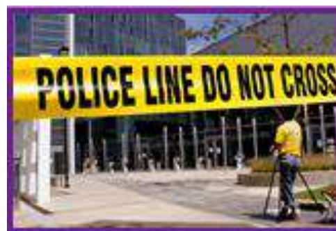
(Staged scene with Professional Models)

Reporters need to understand the specific challenges that victims face in being the subject of an Act I story. While individuals vary in their response to trauma, only a handful of victims are likely to be both composed enough and eager to speak to the media immediately after being victimized. Victims often need time to recover from the initial shock of what has happened to them before they can accurately and fully report the facts and their feelings about them to others. The physical and emotional shock of victimization can literally leave victims “speechless” when trauma disrupts the normal blood flow to the speech centers of the brain.