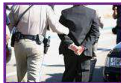
(Staged with Professional Models)

i. A focus on the perpetrator. People have long been fascinated by crime and violence and the people who commit heinous acts. Why do they do it? What kind of people are they? A high-profile case often results in higher circulation and ratings. For victims and their families and friends, this emphasis on the perpetrator can be repugnant. Equally or more disturbing to victims is when family or friends are quoted making positive comments about the perpetrator. The challenge for reporters and editors is to find ways to make stories about victims equally compelling.