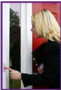
(Staged with Professional Model)