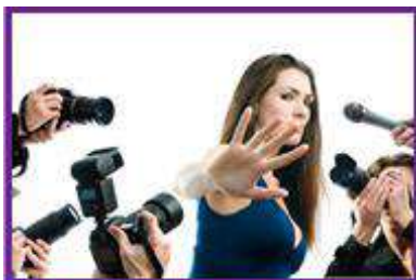
(Staged with Professional Models)

d. “Pack journalism” puts pressure on victims. Crime victims have had their lives torn apart or at least disrupted. So confronting a horde of journalists outside their home is an unwelcome added stress. If staking out the victim’s