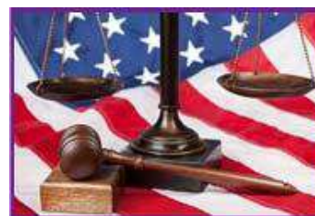
(Professionally Staged Photo)