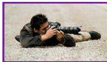
(Staged with Professional Model)

b. Photographers and videographers have special responsibilities. On the one hand, it is important that news organizations do not sanitize the impact of criminal violence in our culture. However, on the other hand, sensational or grisly images often wound victims and their families and friends without informing the public, many of whom are repelled. Although the moving images on television have tremendous emotional impact, they are ephemeral. Still photograph in print or on the Internet can have as much or more impact, since they serve as a permanent record of a specific moment in time. Another problem is that news organizations often rely on visual clichés that have lost their meaning except for the pain they inflict on victims. The body bag on the gurney going into the back of the ambulance or the coffin being lowered into the ground does not mean much to the average reader or viewer, but such images can be particularly painful to victims.