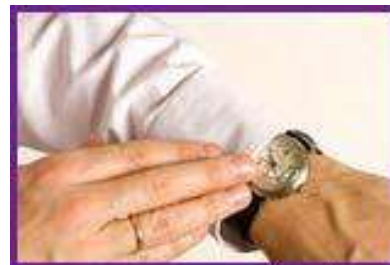
(Professionally Staged Photo)