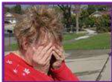
(Staged with Professional Model)