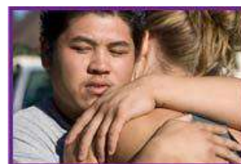
(Staged with Professional Models)

f. Improving cultural competency. As the issue of prominence and celebrity above reminds us, news organizations continue to struggle with issues of diversity. Though print and broadcast newsrooms have made strides in recruiting women and minorities, declines in revenues threaten to reverse those trends and both groups continue to be underrepresented in media management. 2