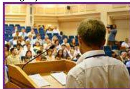
(Staged with Professional Models)

g. Anyone can cover anything. Many news organizations want reporters who can cover anything, with little or no time spent in preparation. Yet many people, including reporters, simply do not know much about crime and victimization. Reporters can therefore grow up believing myths or half-truths concerning certain kinds of crimes without realizing that the information is erroneous and that it has the potential to bias their coverage and inflict pain on victims. News organizations should consider training reporters who cover victims on how to do so with sensitivity, compassion, and respect. Schools of journalism should also incorporate this instruction into their curriculum so that all future reporters and editors receive this training.