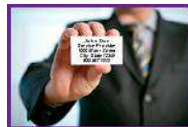
(Staged with Professional Model)

Leave a business card. It is appropriate to offer a business card, suggesting that the victim may want to speak at a later time. Reporters sometimes leave a business card with a short note at a victim's home when the person is not home or do not answer the door. In that note, you should acknowledge the person's experience and explain the mission of the story in your message in addition to providing contact information and asking for an interview.