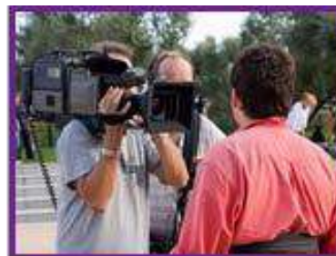
(Staged with Professional Models)

Each “act” of crime coverage poses a different set of challenges for victims, their families and friends, and the victim advocates and service providers who work with them—and for the reporters, photographers, videographers, and editors who cover them. The following offers information, insights, and tips that reporters need to deal with the opportunities and constraints for each of the three acts of crime coverage.