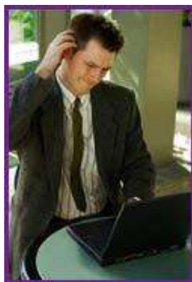
(Staged with Professional Model)

Newman found that the good news is that many journalists are relatively resilient. Less than 6 percent of 875 photojournalists surveyed and less than 5 percent of 906 print journalists studied in 2003 appeared to suffer symptoms of PTSD (posttraumatic stress disorder). (It should be noted, however, the study samples were not randomized so the actual rates remain unknown. Newman also notes there is concern that rates of PTSD may rise over time.)