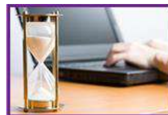
(Staged with Professional Model)