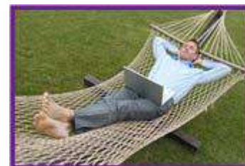
(Staged with Professional Model)