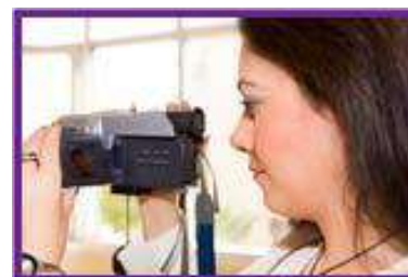
(Staged with Professional Model)