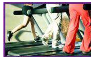
(Staged with Professional Models)

The Dart Center for Journalism and Trauma offers a self-guided tutorial for journalists that explains the signs and effects of traumatic stress and how to cope with its effects. This information is helpful to increase knowledge about how trauma affects crime victims, as well as reporters who may be continually exposed to traumatic events. The tutorial can be accessed at