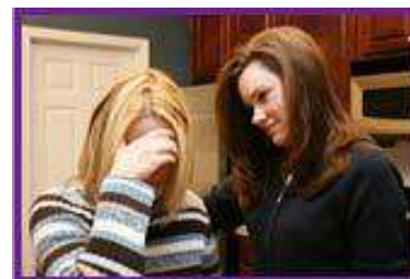
(Staged with Professional Models)