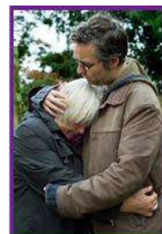
(Staged with Professional Models)

• Share information and discuss next steps. Assure the person you will follow up. Give the individual the names of law enforcement agencies and officers to contact. (Make sure the person gets something to write down the information or he or she may forget what you said when you hang up.) It also helps to ask if the person is alone. If the person is, encourage him or her to ask a family member, neighbor, or friend to stay with him or her to provide support and, in cases in which an assailant has not been apprehended, tend to any safety needs or concerns.