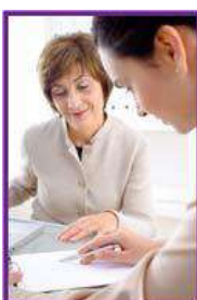
(Staged with Professional Models)

While journalists may be tempted to view these three groups as obstacles to getting an interview, they can also be valuable sources of information and assistance. Victim advocates know the history of the movement and can direct reporters to valuable sources within the field. Service providers typically know the system and can help reporters thread the maze of the criminal and juvenile justice systems. Reporters who develop rapport with these groups can find that they will help them get the interviews they seek.