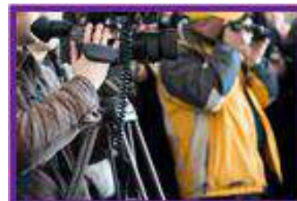
(Staged with Professional Models)

Asking for the interview. For reporters under deadline, the first challenge is to persuade victims to talk to them. The challenge is even greater for television reporters because they want visuals for their stories and victims can be intimidated by the equipment, or they may not want others to see them in their current condition. To be ethical and effective in securing an interview, reporters should: