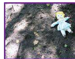
(Professionally Staged Photo)