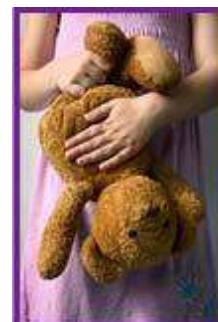
(Professional Model Pictured)

ii. Incest. News organizations also need to exercise special care so that reporting the name of the perpetrator and the nature of the crime in incest cases does not thereby reveal the name of the victim. Some editors ignore such concerns because they insist that people in smaller communities know the names anyhow, so the newspaper need not take special precautions to protect the victim's privacy. However, editors should consider that, especially in today's online news world, archived news stories can be accessed by people inside and outside that community for years to come.