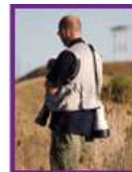
(Staged with Professional Model)