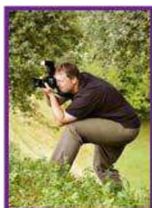
(Staged with Professional Model)

The general test for still and moving images is that photographers and videographers do not need permission in places people have no expectation of privacy, which means people on public thoroughfares are therefore fair game. (It should be noted that schools are public places paid for by tax dollars, but courts allow them special privileges in denying access to reporters.) News media, however, should obscure the faces or other identifiers of people used in stock photos or file footage that portrays them in an unflattering light.