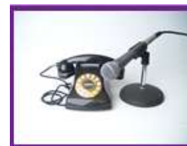
(Professionally Staged Photo)

In terms of technological intrusion, a number of states have laws that prevent people from recording telephone calls without the permission of the other party. The courts have also told reporters that they cannot use electronic eavesdropping devices to gather information.