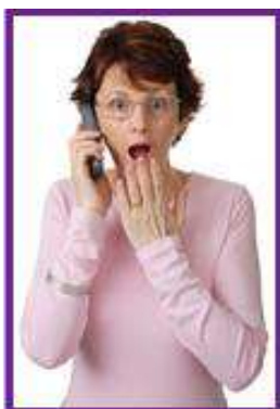
(Staged with Professional Model)

• Verify the identity. Check with the person who answered to make sure you dialed the right number or have the right address. Keep asking questions until you verify that you have the right family. (One reporter did not find that he had contacted the wrong family until he asked the fifth question designed to verify the identification.)