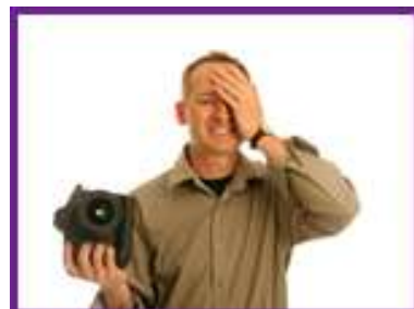
(Staged with Professional Model)

Reporters and editors can suffer from secondary victimization. Like other first responders (police, fire, emergency medical personnel), reporters often see disturbing and gruesome scenes that most people never confront. Interviewing people in trauma can also take a toll. All too often as well, news organizations do not recognize the impact that photographers, videographers, and reporters suffer. Left unaddressed, journalists risk falling prey to unhealthy coping strategies such as self-medicating with alcohol and legal and illicit drugs. Reporters can also become hardened and cynical, in the hope that a tough exterior will protect them from the pain. All too often instead, it merely makes them insensitive to others. Another common coping technique is employing so-called “gallows humor” to distance themselves from victims’ pain. As this suggests, however, such mechanisms can make it difficult for journalists to remain sensitive to victim issues and concerns. News organizations should foster a culture where journalists feel comfortable talking about their feelings about doing tough stories. News organizations should also offer support and counseling to employees who need help dealing with secondary trauma without fear that doing so would harm their careers (see “What Journalists Can Do To Take Care of Themselves” in this Section).